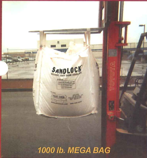
1000 lb. MEGA BAG