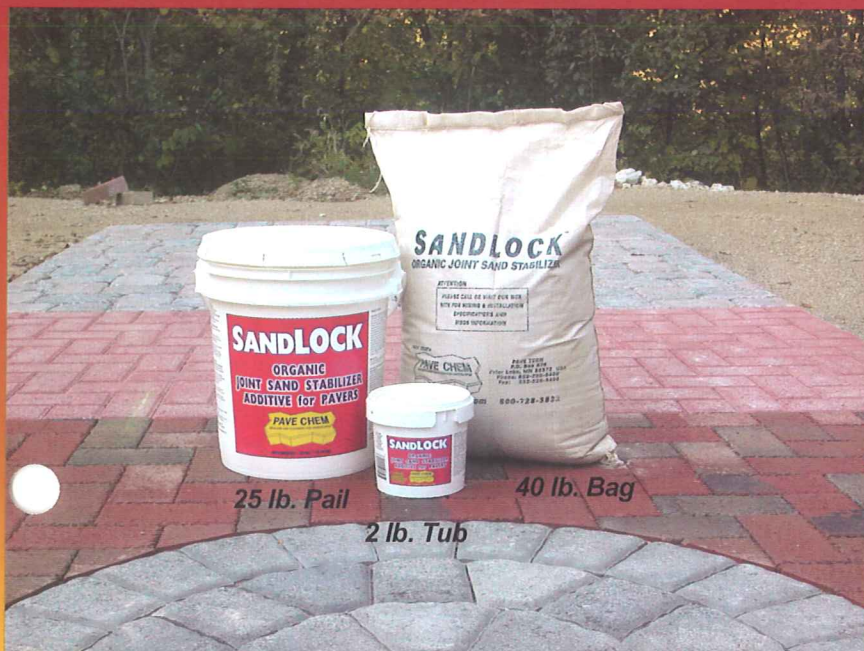
25 lb. Pail